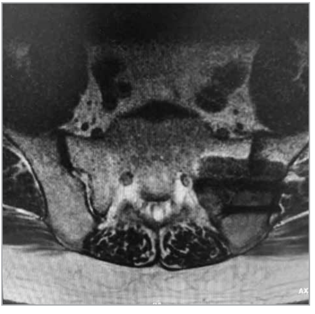
Fig. 2. Axial magnetic resonance image indicating SIJ fusion hardware impinging into the S1 neural foramen.

Novel SCS waveform trials should be considered by pain management physicians who encounter future